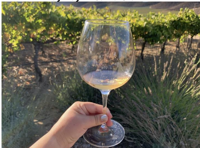
Wine Tasting in San Benito County