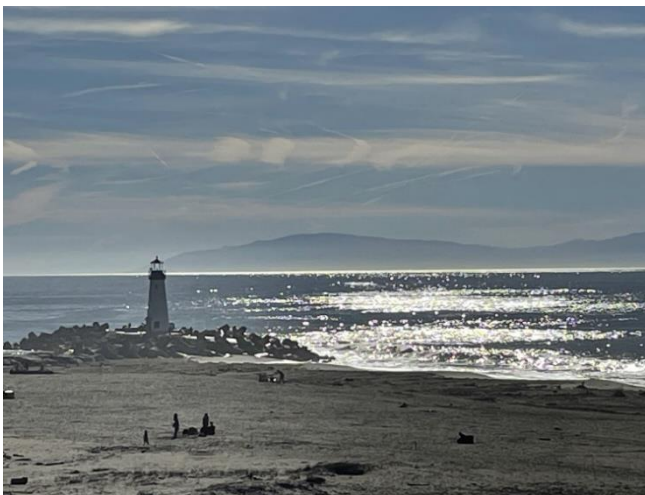
Play Day in Santa Cruz

Here are a couple of donations you can bid for on May 19 as you enjoy the potluck brunch: